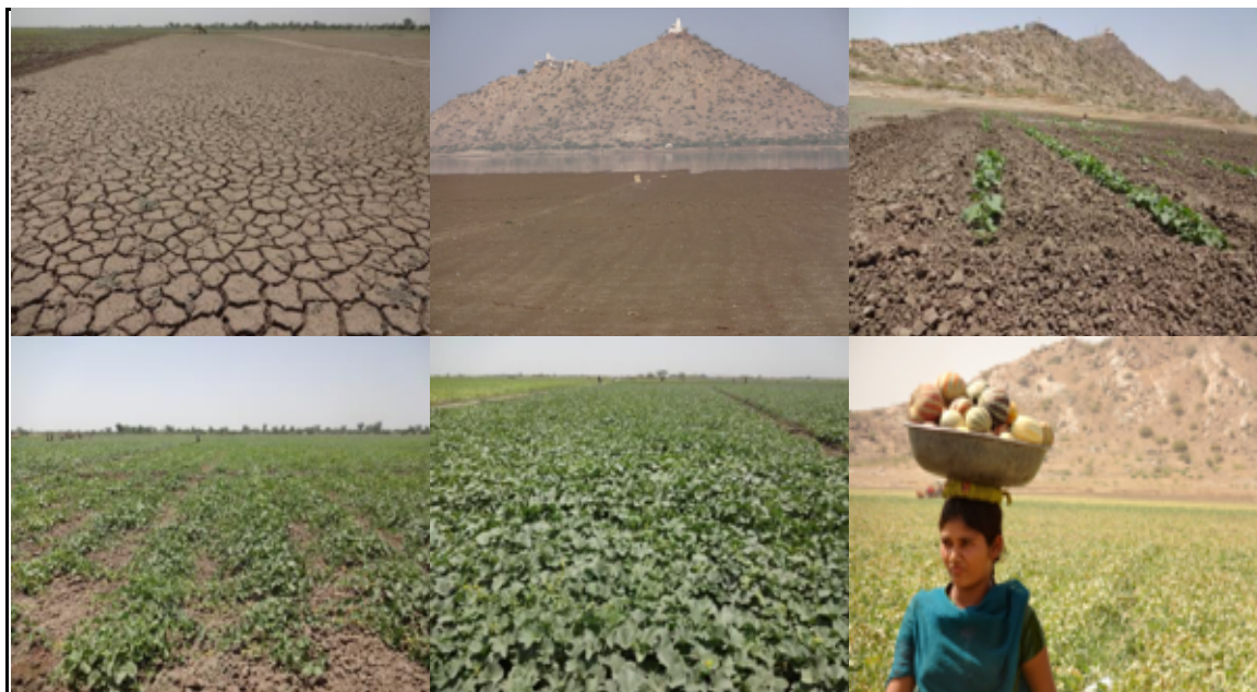
Figure 1: Effect of conserve moisture and irrigated conditions with input levels on growth and yield parameters of muskmelon

during different phenol phases. Besides this, the arid region has several biotic and abiotic limitations that are responsible for low productivity (Faroda et.al. , 2007).