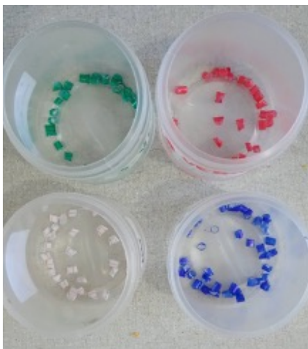
Figure 1: Straws separated by color before being poured into the scouts.

breeding them with soy bran and leaving them to rest for 24 hours at room temperature. The figure below shows the straws separated by their respective colors.